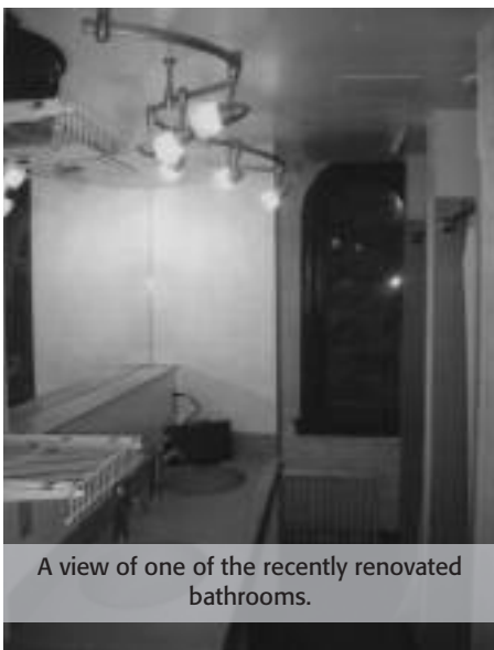
A view of one of the recently renovated bathrooms.

On campus, our presence has greatly increased through our participation in university-sponsored events. Our participation in (continued on page four)