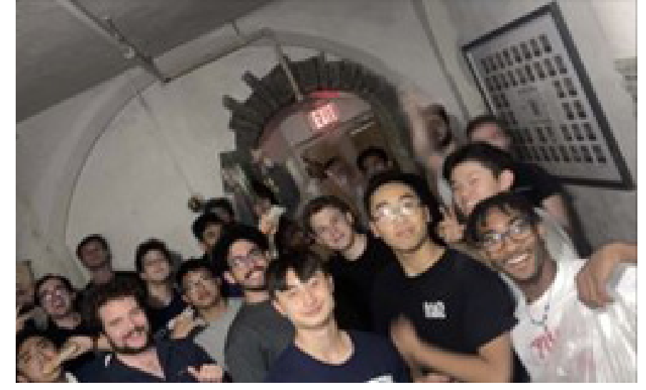
Brothers gear up in the dining hall for an exciting night.