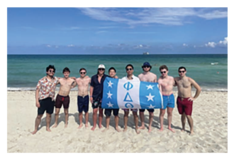
Brothers hit Miami Beach, FL, during spring break.