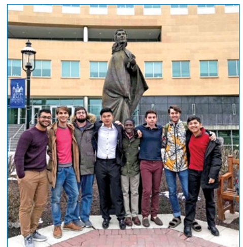
Phi Delta Theta Providence Retreat.