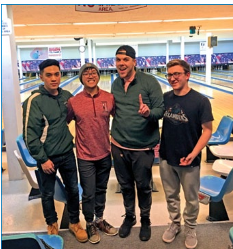
Celebrating the first intramural bowling win.