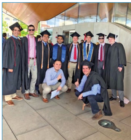
The graduating seniors of the class of 2019.