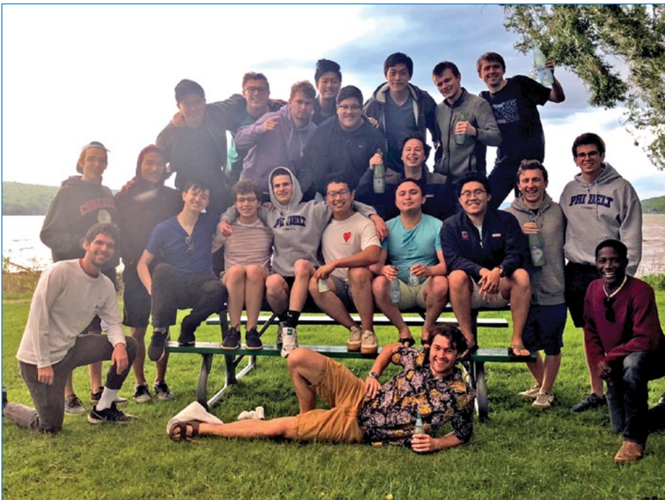
Brotherhood barbecue at Stewart Park.